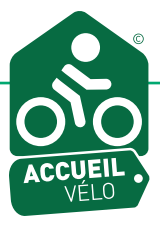
Saint-Hilaire-de-Riez, Atlantic Coast