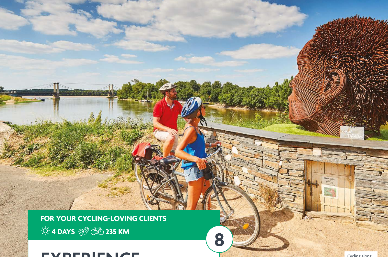
Cycling along the Loire River