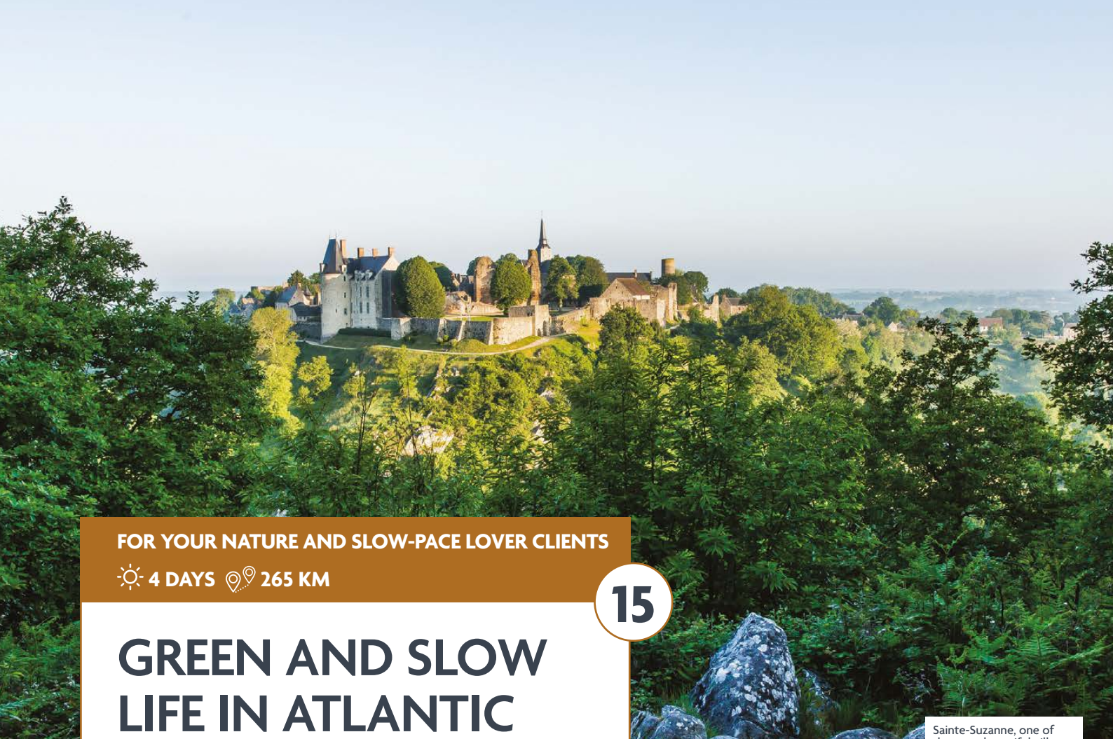
Sainte-Suzanne, one of the most beautiful villages of France, Mayenne

FOR YOUR NATURE AND SLOW-PACE LOVER CLIENTS