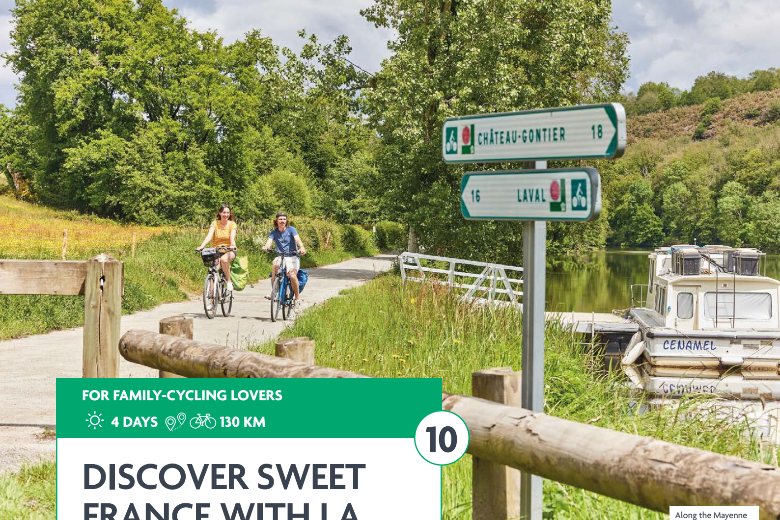
Along the Mayenne towpath