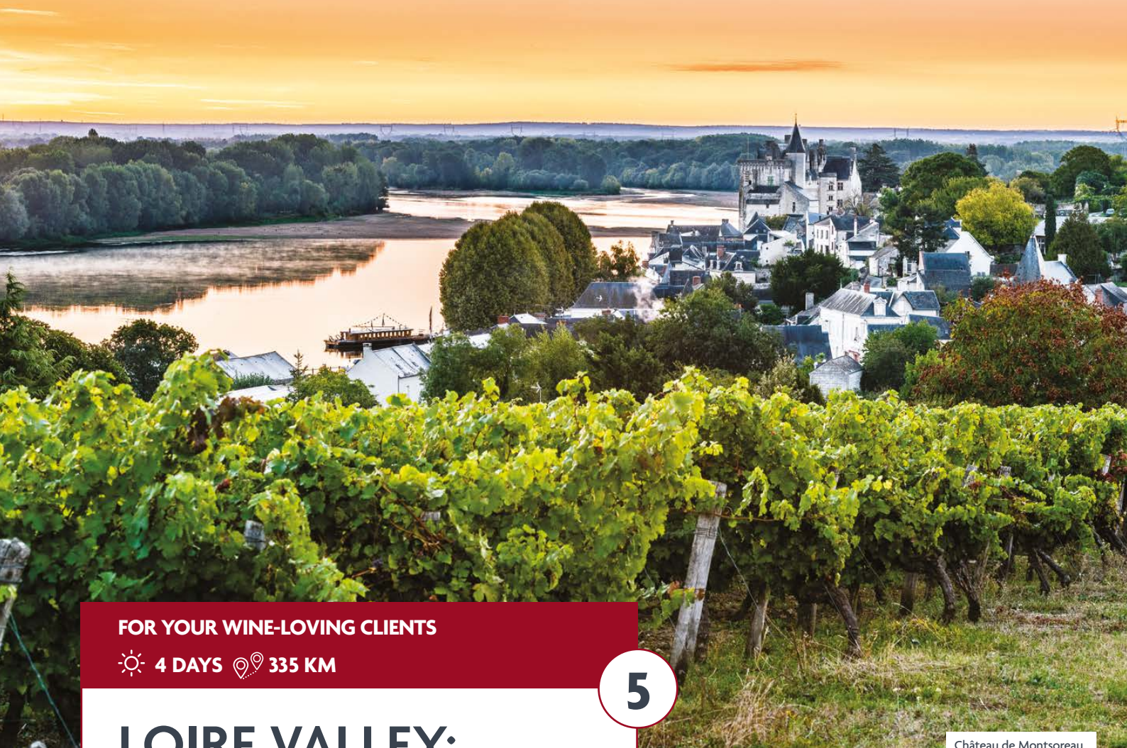
Château de Montsoreau, Loire Valley