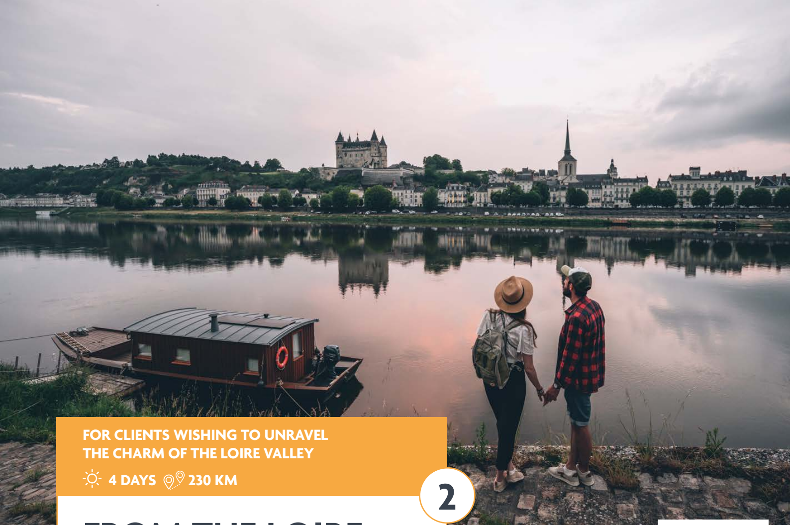
Saumur and the Loire river

FOR CLIENTS WISHING TO UNRAVEL THE CHARM OF THE LOIRE VALLEY