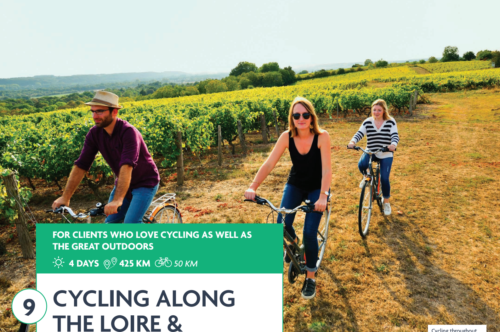
Cycling throughout the Jasnières Vineyard

FOR CLIENTS WHO LOVE CYCLING AS WELL AS THE GREAT OUTDOORS