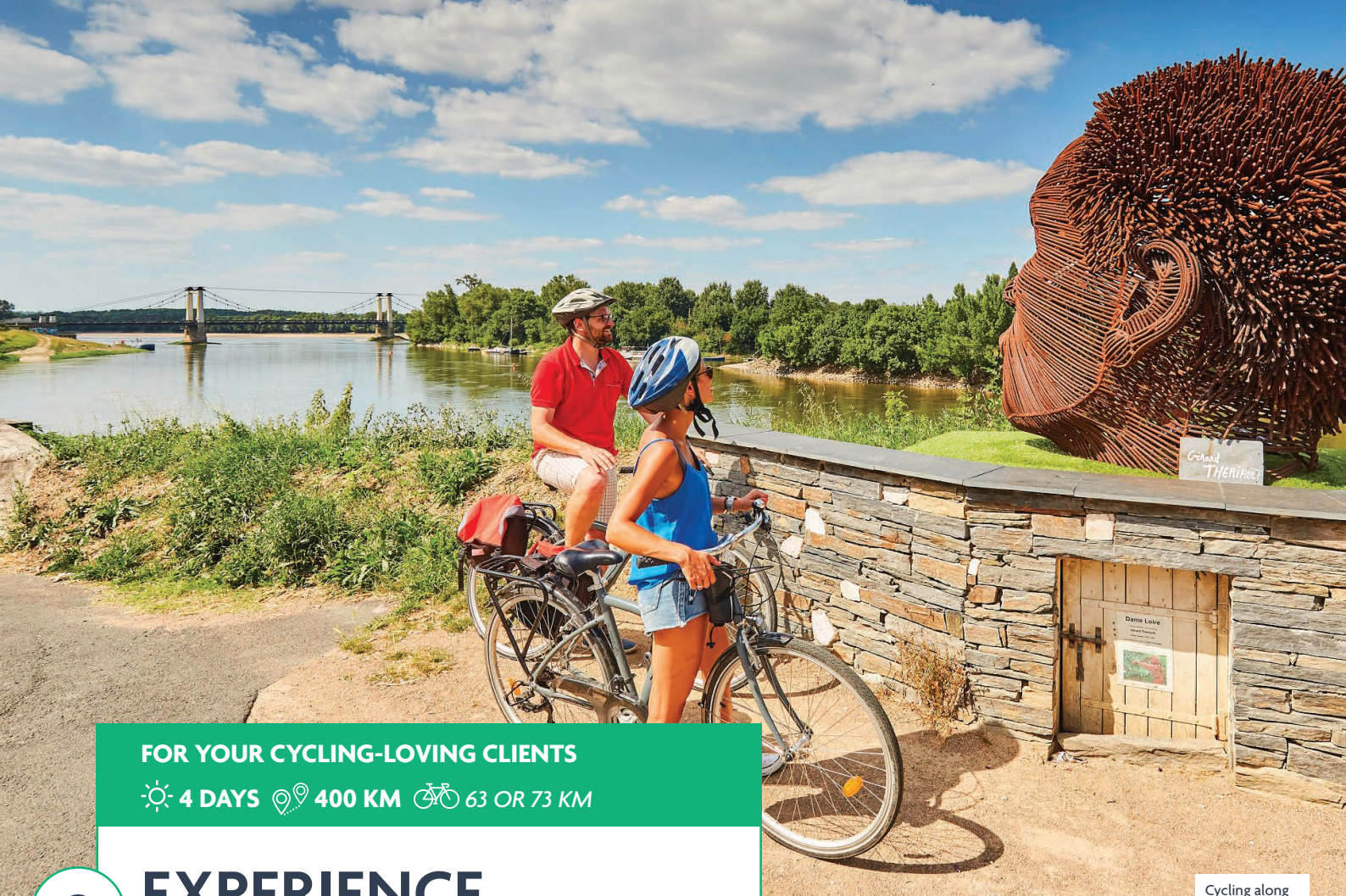
Cycling along the Loire River