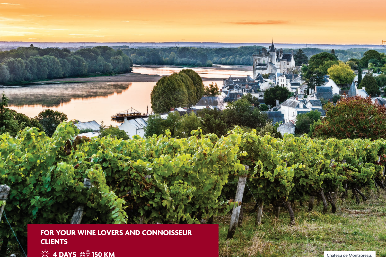
Chateau de Montsoreau, Loire Valley

FOR YOUR WINE LOVERS AND CONNOISSEUR CLIENTS