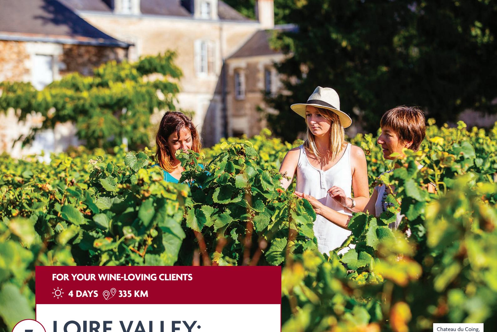
Chateau du Coing, Nantes vineyard