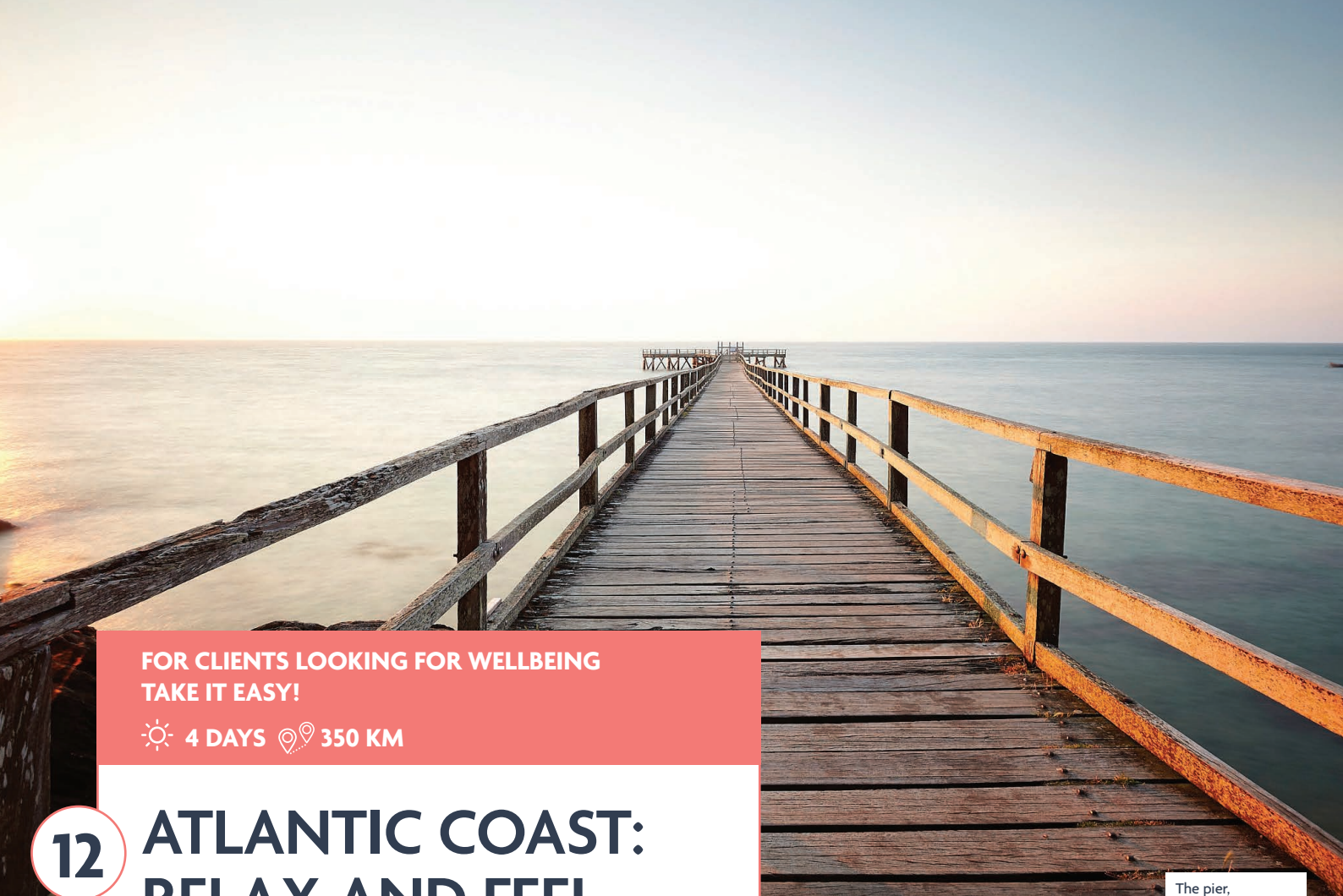
The pier, Noirmoutier Island

FOR CLIENTS LOOKING FOR WELLBEING TAKE IT EASY!