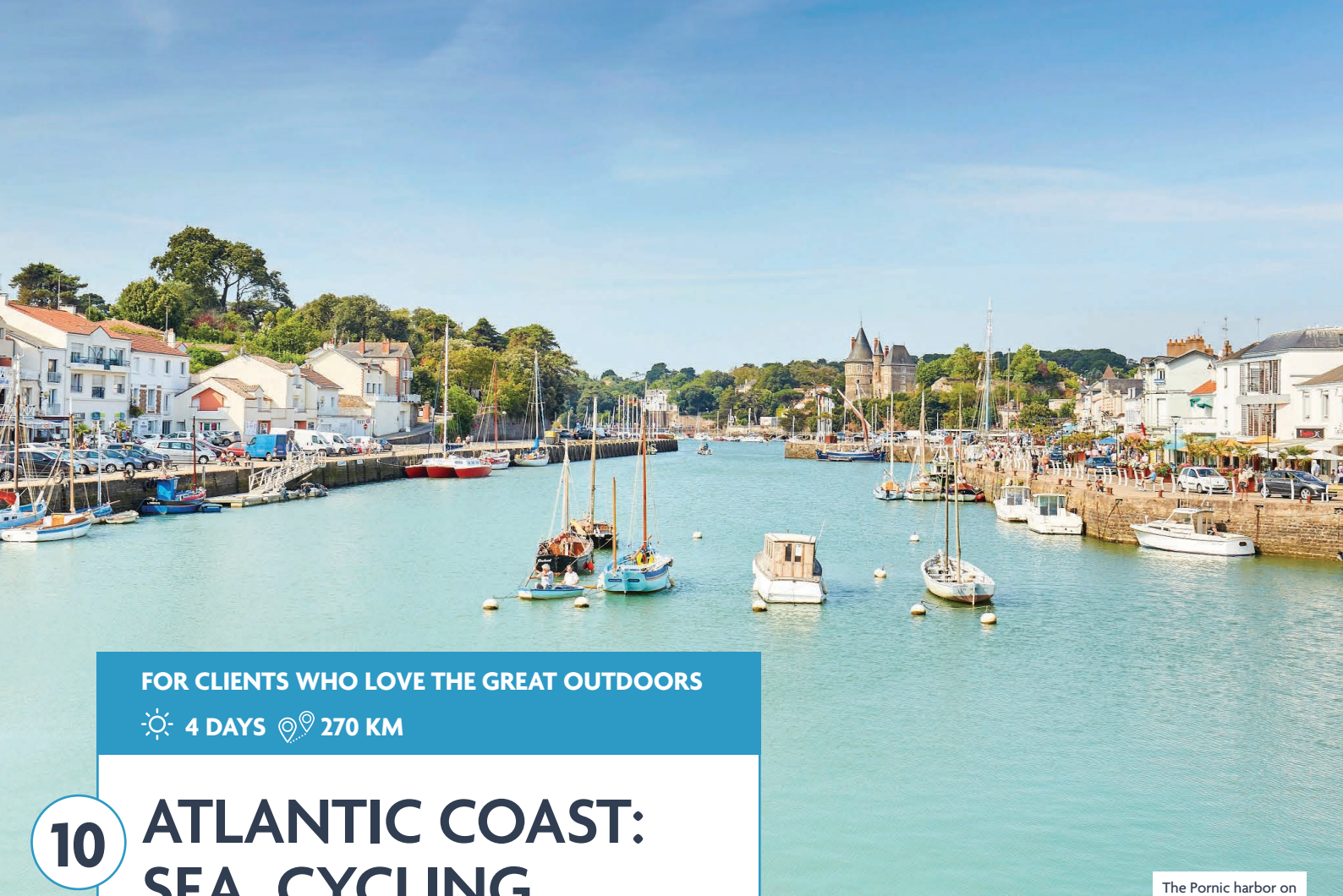
The Pornic harbor on the Atlantic Coast